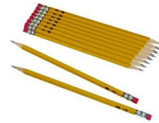
1 box #2 yellow pencils (sharpened)