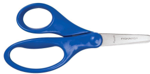
1 pair Fiskar scissors