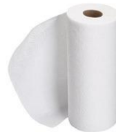
1 roll paper towels