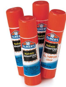
6 glue sticks (or more)