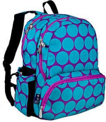
1 backpack (no wheels)