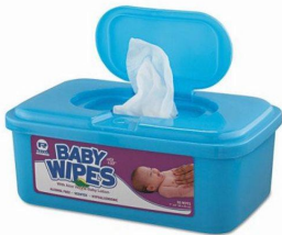
1 box baby wipes