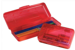
1 plastic pencil box